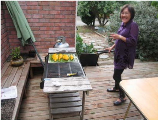
Lum's Ikan Bakar.

Not only has she got to catch the fish, she had to cook them as well!