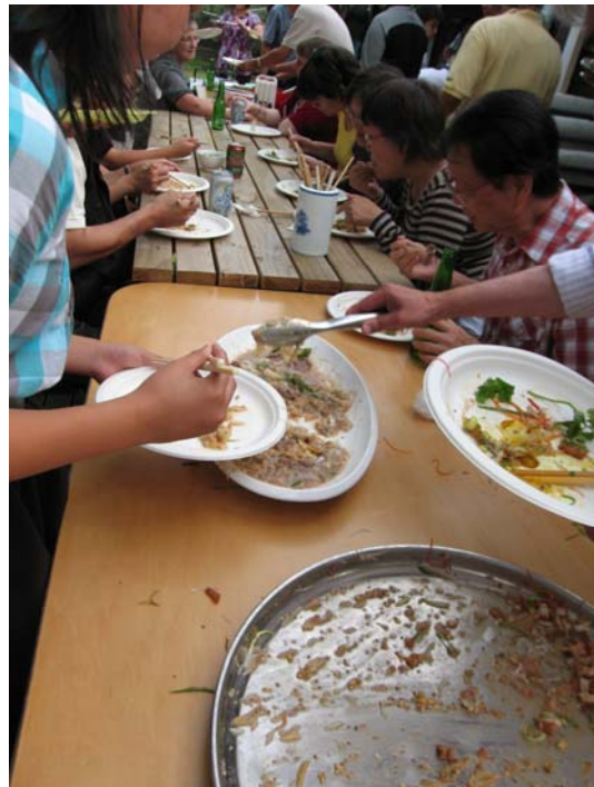
The plates for the "Ngau Yoke Hoh Fun" had a mirror finish when it was over.