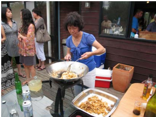
Imported cook from Soo Kee, Jalan Imbi. KL's loss is Auckland's gain!