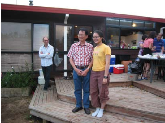
The youngest and the oldest MBSian in the party were visiting New Zealand.