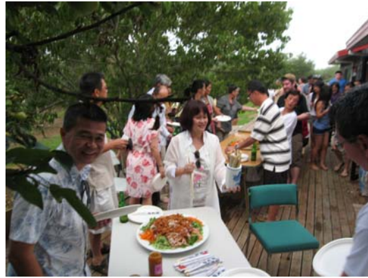
Ready for the big "loh"